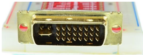
Figure 5: DVI-I dual link male