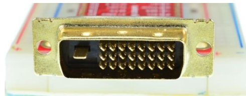
Figure 6: DVI-D dual link male