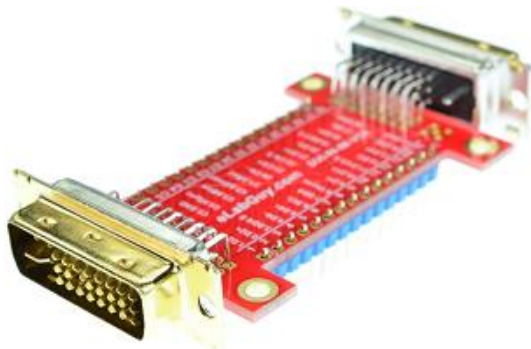
Figure 3: DVI-IM-DM-V1A with headers