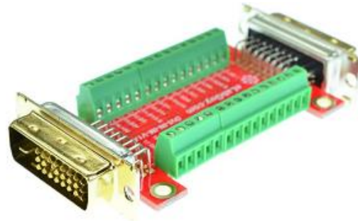
Figure 4: DVI-IM-DM-V1A with terminal block